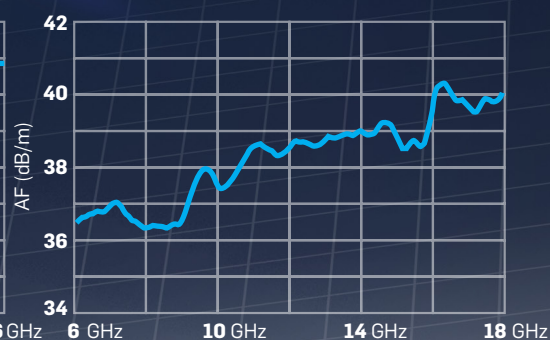
DR-01 - Antenna Factor