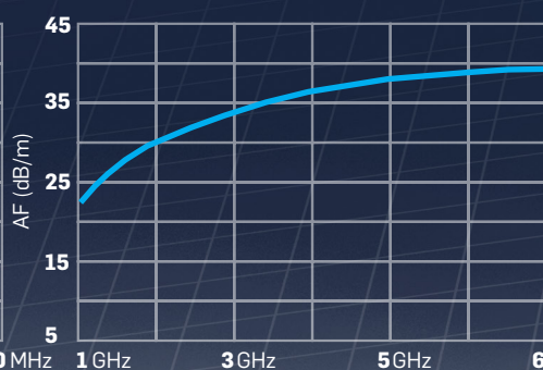
LP-04 - Antenna Factor