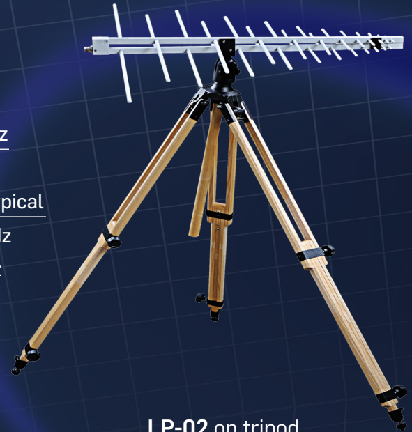
LP-02 on tripod